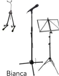
Bianca Violin 2 & backing vocal